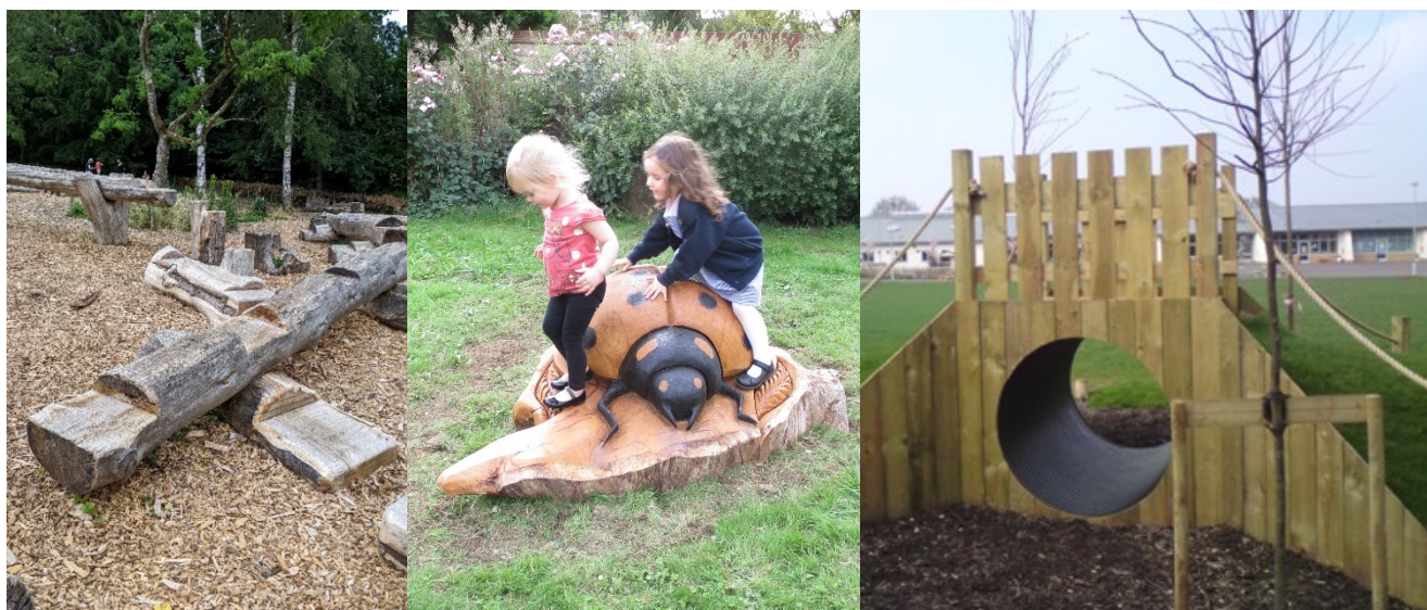
Figure 1. (left) Collection of logs and stumps at Dyffryn Gardens (Alice Jones), (centre) sawn landscape feature, and (right) ditch and mound system with tunnel (Jane Bain) (CC BY-ND 2.0).

4.1.10. It is important to examine the intended location to identify any existing elements which may provide chances for play (e.g. trees, natural earth formations, slopes). The design and layout of a path through an area can become a play opportunity (e.g., within a grassed area, a mown meandering path can form a maze for smaller children, while trees and bushes with fallen branches/twigs can provide possibilities for den making).